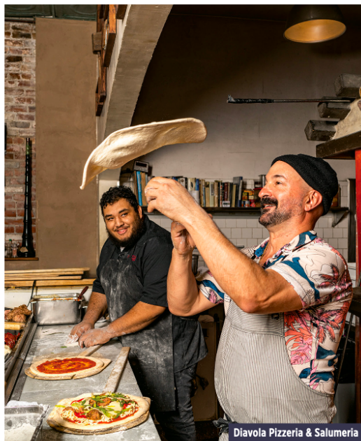
Diavola Pizzeria & Salumeria

1474 Alexander Valley Road, Healdsburg; (707) 431-5250; jordanwinery.com