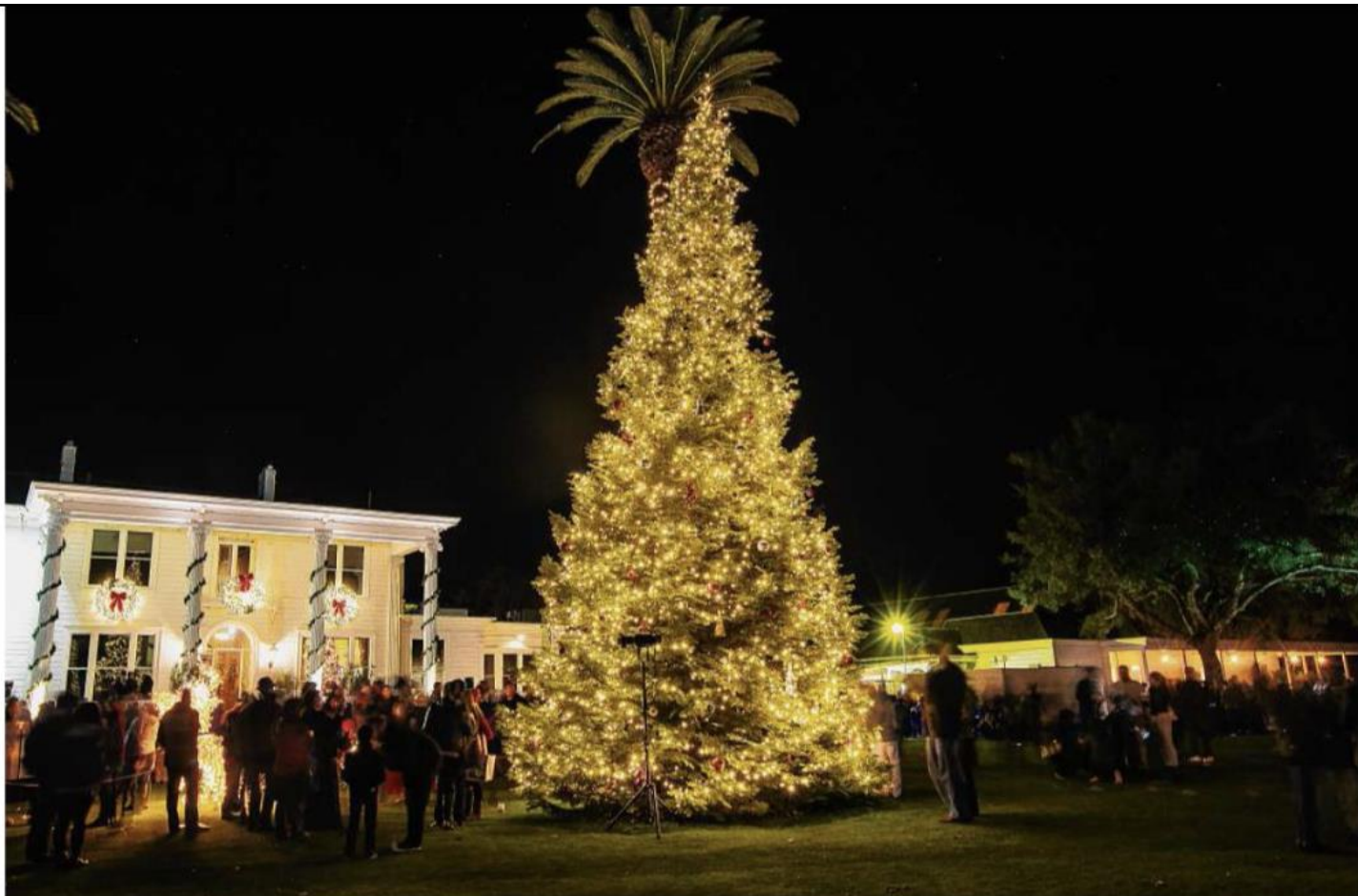
SILVERADO RESORT & SPA

Napa's Silverado Resort & Spa will host a festive tree-lighting ceremony with free cookies and cocoa, live music and a visit from Santa Claus at 6 p.m. Nov. 25.