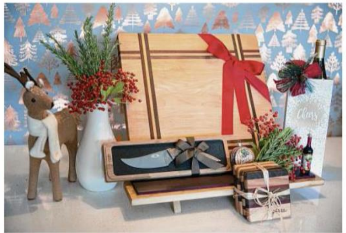
CULINARY INSTITUTE OF AMERICA AT COPIA

Clockwise from top left: Jordan Vineyard & Winery sells custom spice blends, created to pair perfectly with Jordan wines, including the Lazy J Rub and the Chardonnay Lover's Rub; a Napa Valley vineyard is decorated in holiday lights; the Culinary Institute of America at Copia features a variety of gifts, including a French-made Laguiole knife in a wooden box or a large walnut cutting board crafted by a Napa woodworker; visitors enjoy the Merry Meritage, the holiday village of Meritage Resort & Spa.