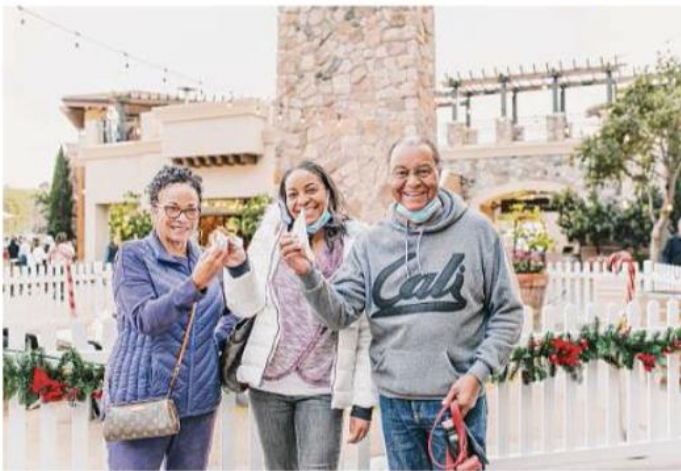
MERITAGE RESORT & SPA