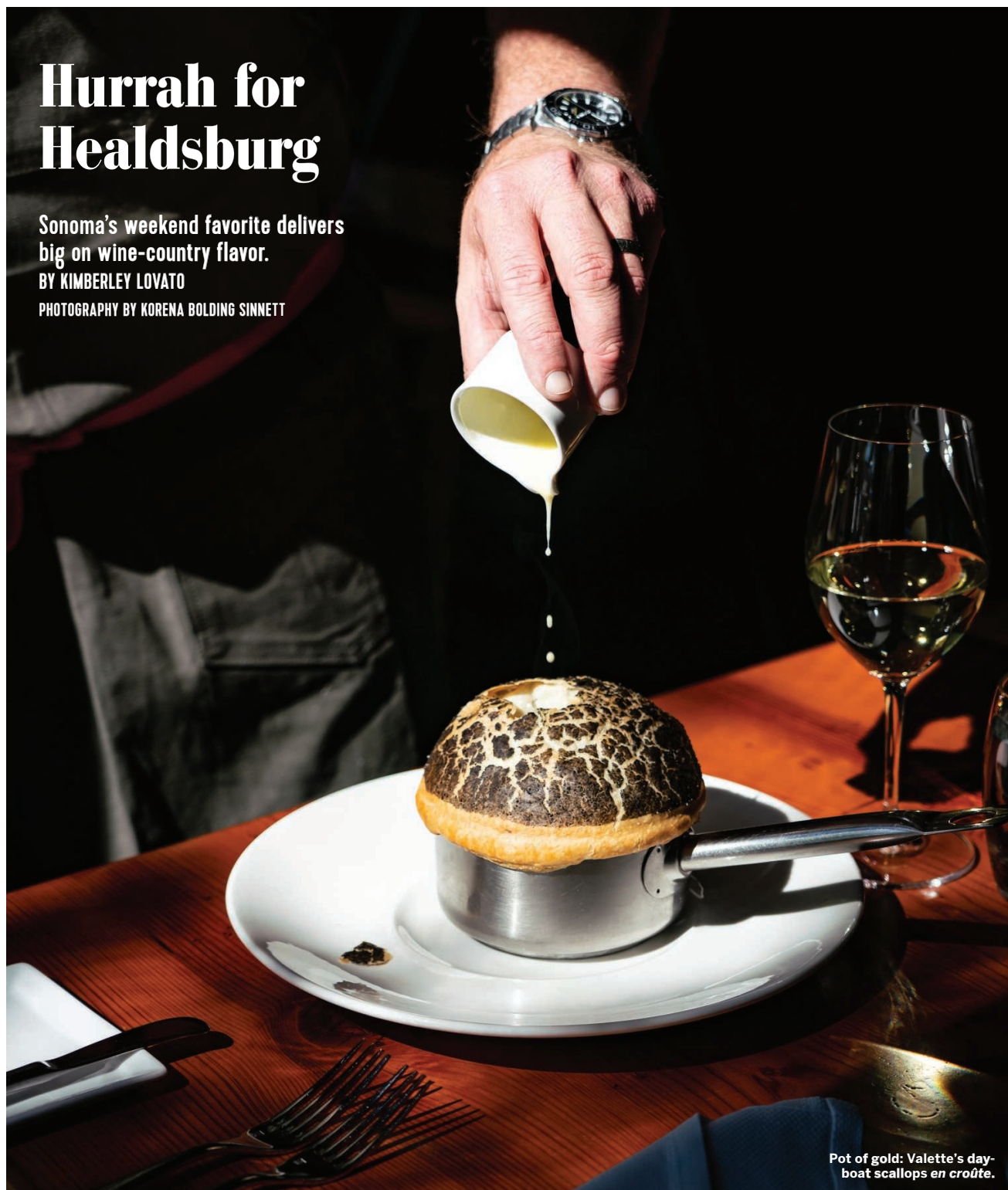
Pot of gold: Valette's day-boat scallops en croûte .