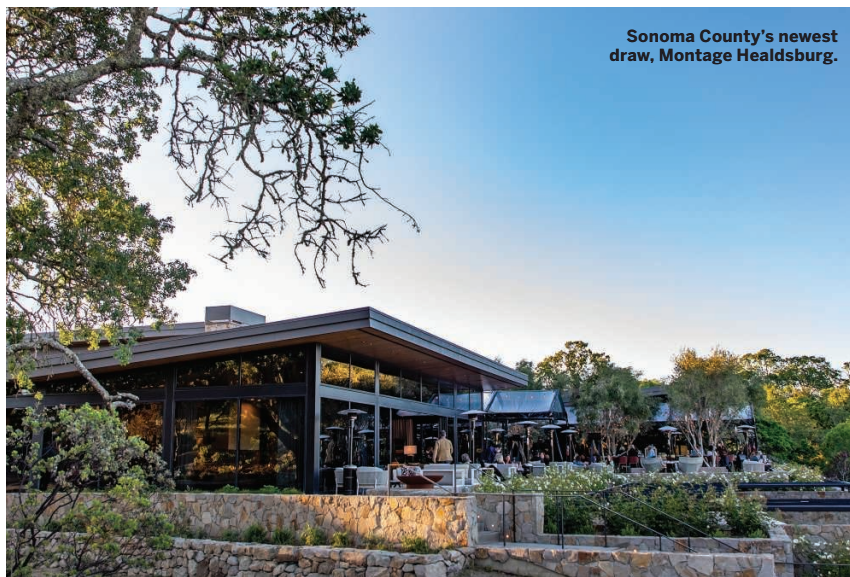
Sonoma County's newest draw, Montage Healdsburg.