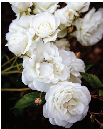
Clockwise from left: Healdsburg flora, Hazel Hill's lobster tartine, and prepped for the grill in Single Thread's open kitchen.